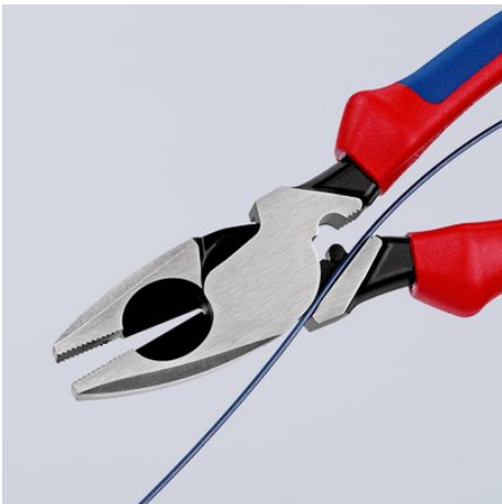
09 11/12 240: fish tape puller in the joint gap