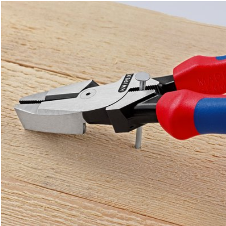
Gripping zone below the joint for powerful leverage