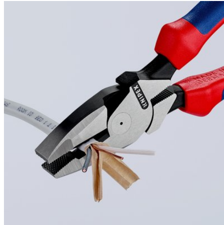
Long cutting edges for cutting flat cables