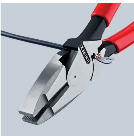
09 11/12 240: universal mandrel crimping area below the joint