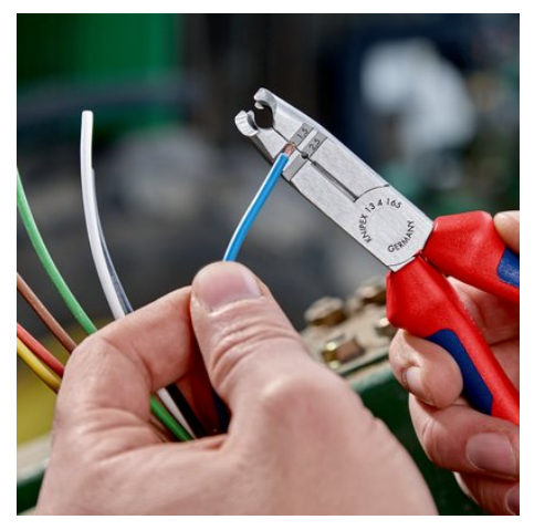
wire stripping holes for 1.5 and 2.5 mm² conductors