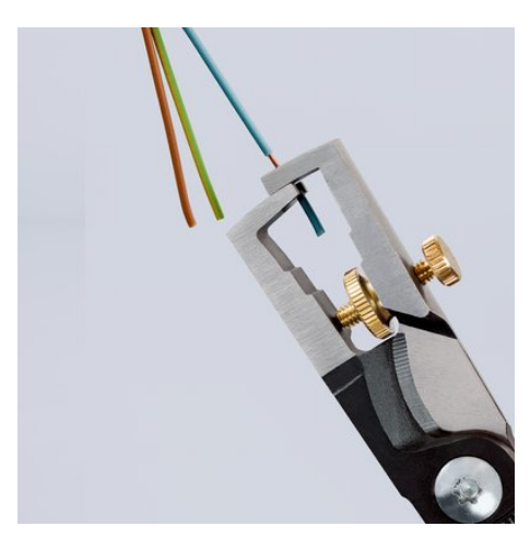
Length mark: Profiling on the inner side helps when stripping wire in standard lengths (11 mm and 16 mm)