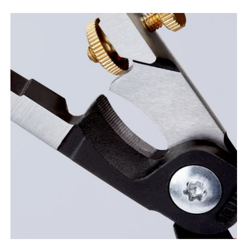
Induction-hardened precision cutter